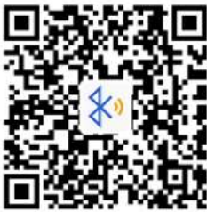
eMedLab APP download QR Code

Provide APP SDK, export high-precision raw data for secondary development