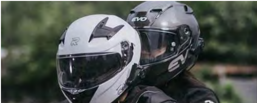
MOTORCYCLE INTERCOM SYSTEM