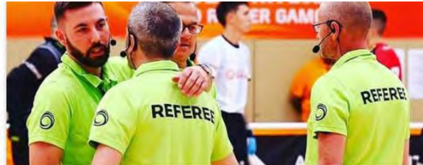
REFEREE INTERCOM SYSTEM