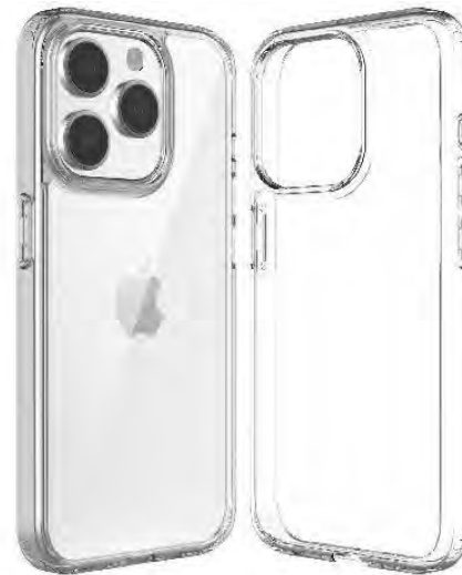
Camera and Screen Protection