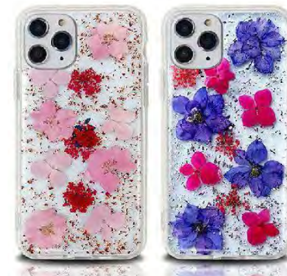
A31 $2.75 300pcs/model/color