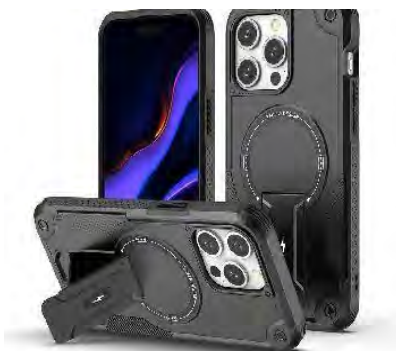
FSPH23121110130 $1.55 100pcs/model/color