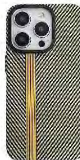
FSPH23121310285 $3.10 500pcs/model/color