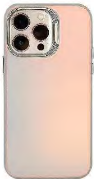
FSPH23122110080 $1.05 100pcs/model/color