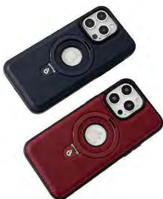
FSPH23123310258 $2.83 100pcs/model/color