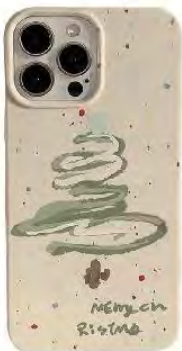
FSPH23120310080 $1.05 100pcs/model/color