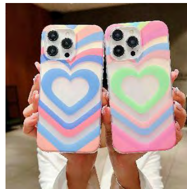
FSPH23123010120 $1.30 300pcs/model/color