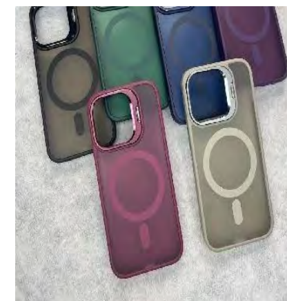
PC024-0004 $2.60 300pcs/model/color