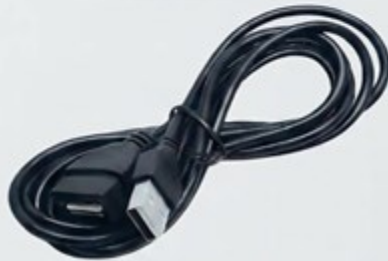
USB CABLE x1