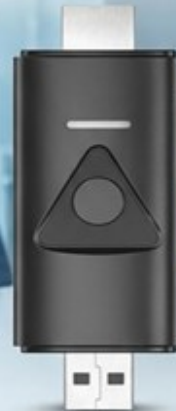
RECEIVER: TV/Display End