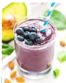
P / 6 Speed