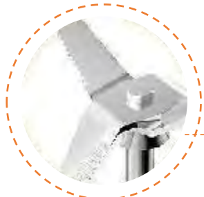
STAINLESS STEEL BLADE