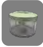
150ml AS Bottle