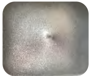
Fry pan hump design