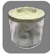
300ml AS Bottle