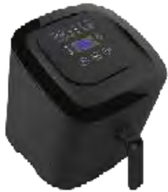
Special body incline design