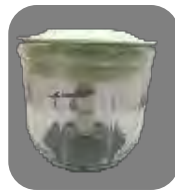
300ml Glass Bottle