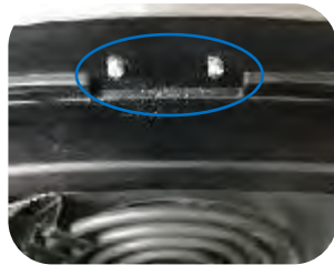
Metal micro switch