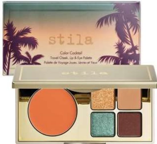
Mini Cheek, Lip & Eye Palette - Tequila Sunrise Model: SC87010001 | UPC: 94800361287

Global Traders: Operators of the Unconventional Inventory Liquidation Marketplace FreeWorldImports.com