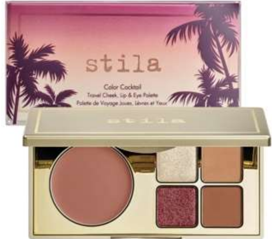
Mini Cheek, Lip & Eye Palette Malibu Sunset Model : SC87020001 | UPC : 94800361294