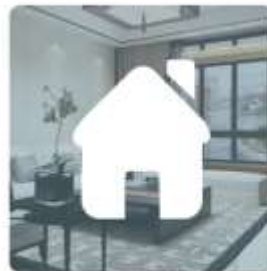
Measure room temperature