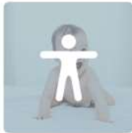
Take body temperature

Switch body temperature and table temperature with one key. Various temperatures around, convenient and worry-free.